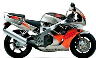
Example of a pure 'on road' design bike

If your bike falls into the category where it has some on road features but is predominately an off-road bike, the Administrator may grant Import Approval if you agree to the following: