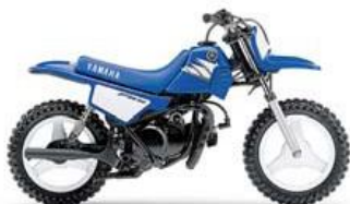
Example of an 'off road' bike

Generally if a bike was designed principally for 'on road use' and has lights, blinkers, side mirrors and provision for a number plate, it is regarded as an ON ROAD bike. However there are cases where some bikes are manufactured with the above features but are still regarded as an off road design. Below are examples of off/on road bikes: