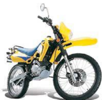
Example of a bike that has 'on road' features but could be also classed as 'off road' bike.